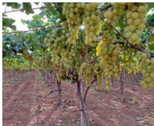
Fig. 1. Photos of table grape parcels (cv. Muscat) grown with "Pergola" system