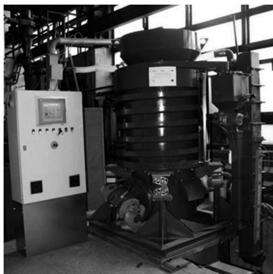
Fig. 1. The vibratory reclaimer REGMAS at the background of the reclaim charging system of the pneumatic classifier

wards to the charging opening of the cascade-type pneumatic classifier.